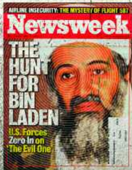
WAR IN AFGHANISTAN